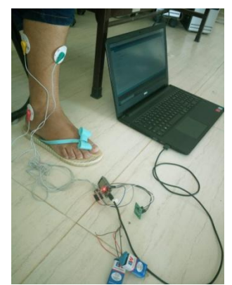
Fig 2: The Circuit connection for the proposed block diagram.

The proposed block diagram consists of EMG Sensor, Accelerometer, ADC and Arduino. The EMG sensor is used to analyze the muscle activity and the obtained sensor values are given to the ADC which is then given to Arduino and displaying it through a graph. The Accelerometer is used to obtain the tilt position of the foot.